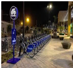
Fig.No 1: Public Bicycle Sharing System Dockless

Most of the Asian cities are facing several socio-economic problems related to transport such as traffic congestion, airpollution, GH Gemissions, traffic accidents and fatalities, noisepollution among others. It is estimated that road congestion alone cost Asian countries 2-5% of their GDP annually due to countless hours of delay, loss of economic opportunities and the waste of billions of gallons of fuel and higher transport cost.