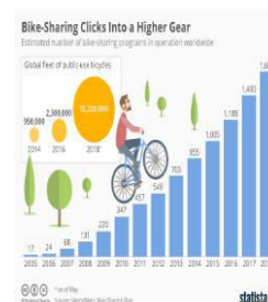
Fig.No 2: Rises in the used of PBSS

According to WHO, an average of 15 million people are injured in urban road accidents in developing countries each year and the majority of victims are poor pedestrians and bicyclists. The Public Bicycle Sharing System (PBSS) is firstly introduced in Amsterdam in year 1965.